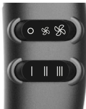
Fig./Img./Abb./Afb./ Rys./Obr. 2